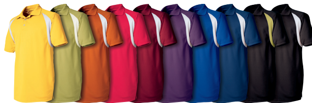
YELLOW/WHITE VEGAS GOLD/WHITE BURNT ORANGE/WHITE RED/WHITE BURGUNDY/WHITE PURPLE/WHITE ROYAL/WHITE NAVY/WHITE BLACK/VEGAS GOLD BLACK/WHITE

Perfect for the golf course, tennis court and much more, this ladies 5 oz. short-sleeve raglan polo will keep you cool under pressure! Made of 100% polyester, this stylish item features advanced 3M Scotchgard moisture-wicking technology, which draws moisture from the skin to the surface of the shirt to keep your dry and comfortable. It has a curl-free collar, a V-neck placket with box-stitch detail, hemmed cuffs, shoulders, a straight bottom, side vents and pearlized buttons. Available in sizes from XS to 4XL and in several colors, this popular polo will make a lasting impression.